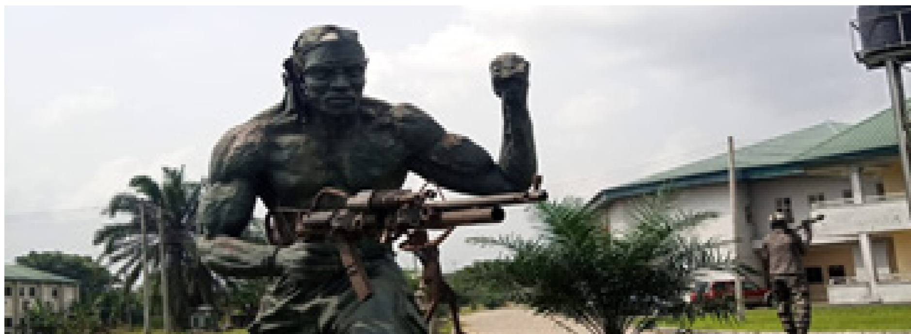
Plate 1: Sculpture depicting an armed militant as a freedom fighter