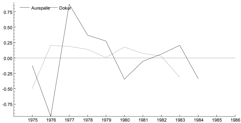
Figure 1 Crop shock in Aurepalle and Dokur in Andhra Pradesh

Note: Crop shock is averaged for each village.