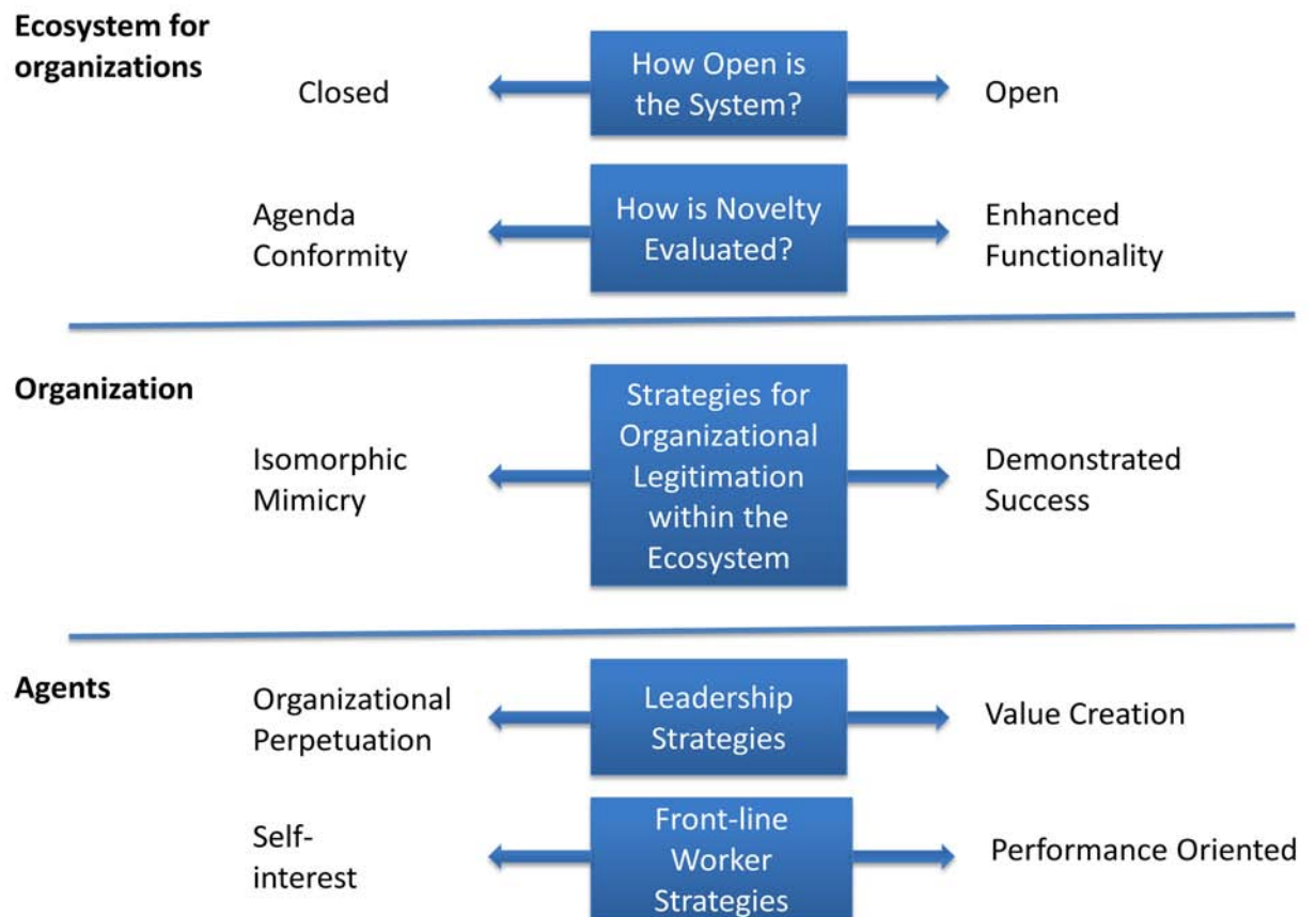
Figure 1: Tensions playing out at different levels of engagement in development